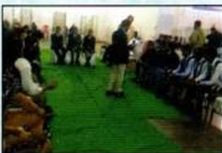
Third Position bagged by DPS, Bilaspur in Quiz Competition organized by Indian Postal Services, Bilaspur Division at Raghendra Rao Sabha Bhawan on 3rd January 2019.