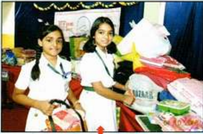
Joy of Giving

DPS Bilaspur organizes a plethora of activities for the children, which helps the children to understand that joy of living is a result of holistic development of personality.