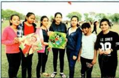
Kite Festival at Makar Sankranti