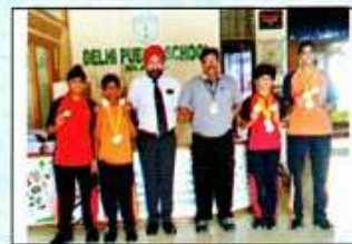
State Level Swimming Championship (Students bagged 13 Gold, 1 Silver & 1 Bronze Medals)