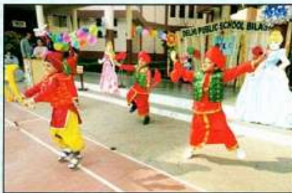
Fun & Frolic