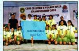
DPS Girls Volleyball Team won Second Position in CBSE Cluster II Volleyball Tournament