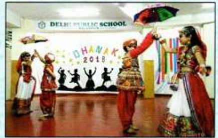
Mega Dance Show "Dhanak 2018" (109 students participated)