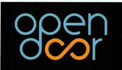
Open Door- A mastery Assessment Program which help the student to think freely and question. It has been recently introduced in DPS, Bilaspur in the classroom Programme of classes VI to VIII for Science and Mathematics. It develops learning experience.