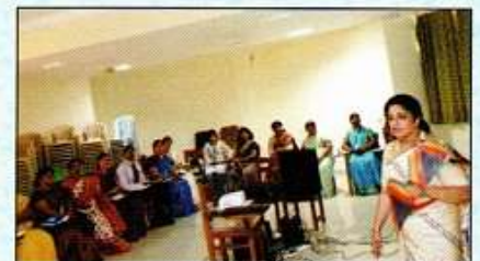
Workshop on Communicative English