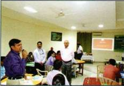
Capacity Building on Mathematics conducted by CBSE at DPS, Bilaspur