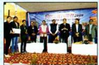
Stamp Designing Competition organized by Indian Postal Services, Bilaspur Division at Raghendra Rao Sabha Bhawan