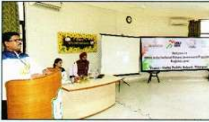
Capacity Building on Physical Education conducted by CBSE at DPS, Bilaspur

Staying updated is the key to success in any field especially in the field of education. Our teachers constantly strive to stay updated by attending workshops and various training programmes.