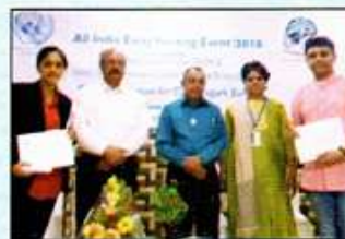
CBSE far East Zone Skating Championship (Students Bagged 3 Gold, 5 Silver & 2 Bronze medals)