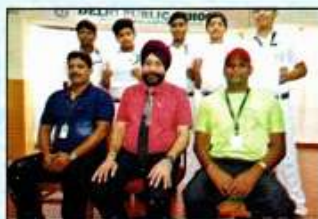
Wrestling Competition (Students bagged 1 Silver)